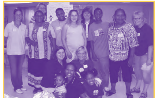
Prevention First staff members and program participants gather around for a group photo.

Prevention First’s Strengthening Families program aims to teach parents how to spend special one-to-one time with their children. In the process, parents build their ability to pass attention to their child and strengthen their parent/child bond before attempting to use new discipline approaches. During the program, parents also learn to improve family communication skills and practice their skills with some family discussions.