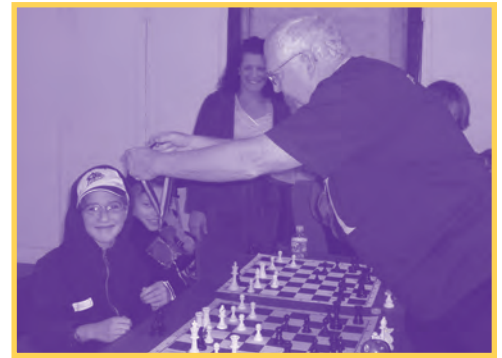
A participant is awarded for checkmating one of the chess masters!

Prevention First and all associated with this annual event greatly appreciated the help provided by New Jersey Natural Gas and