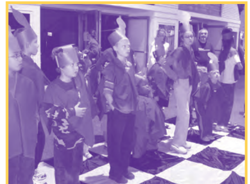
Children dress up as chess pieces in the afternoon's exciting Human Chess Game.

Starbuck volunteers, who assisted in running the day's events. A tremendous amount of gratitude also goes out to this year's event sponsors: Commerce Bank, Food Circus Supermarkets, Meridian Health, Monmouth County Arts Council, New Jersey Natural Gas, Red Bank Title Agency, Rotary Club of Asbury Park, The Children's Hospital of Monmouth Medical Center, The Gary and Tamar Tolchin Foundation, The Zobel Foundation, Wal-Mart and Windmill Restaurants.