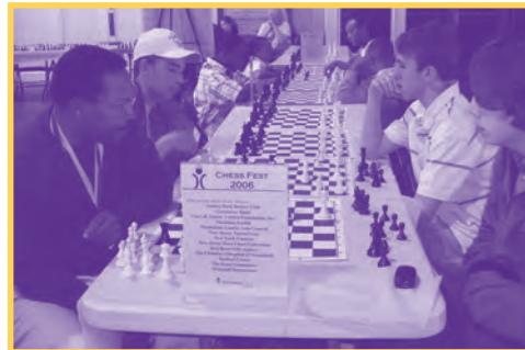
Older participants are challenged by the expertise of New Jersey's chess masters.

concentration. It also provides children with a forum in which to display aggressive behavior in a socially acceptable way while improving self-confidence.