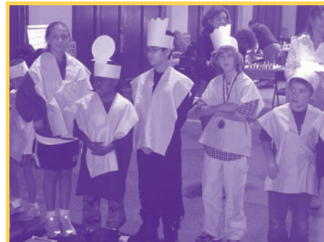
Children dress up as chess pieces in the afternoon's exciting Human Chess Game.