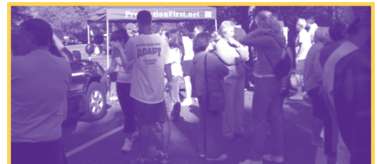
Attendees were up bright and early for event registration!