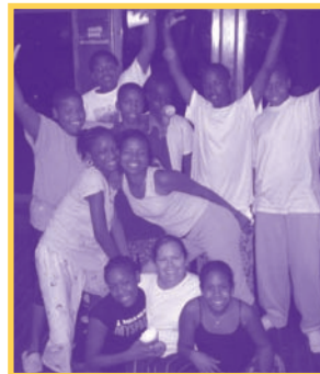
The group poses for a picture their first night staying in the cabin.

Project Vision is an after-school program created by New Jersey Attorney General Peter C. Harvey and ran locally by Prevention First to provide safe havens for local children and teens. The mission of Project Vision is to prevent gang violence by surrounding the youth with supportive and compassionate adults who spend time mentoring the students. The goals of the program are to have students learn to make decisions, respect themselves and others and understand the law. The youth learn to come together and share their thoughts in a safe place, all the while enjoying the time they share together.