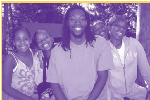
The group poses for a picture their first night staying in the cabin.

Twenty Asbury Park students got a much needed break from home this summer. Students were invited by Prevention First to spend the weekend at Camp Ockanickon in Medford, New Jersey. The trip included activities such as outdoor education, leadership, teambuilding and recreation. Most importantly, the teens got to spend time with one another, building friendships and memories that will last a lifetime.