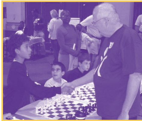
Let the games begin!

Onlookers were invited to join the festivities and watch the featured event, the "Human Chess Game." This unique and fun game features children and chess masters as actual playing figures on a life-sized chessboard.