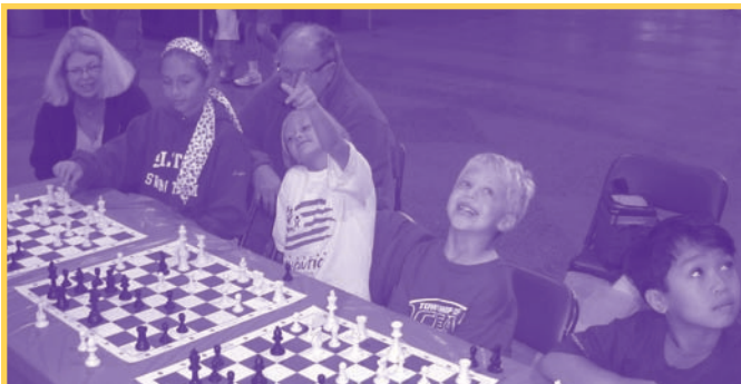
The youngest of the day's participants are taught the basics of chess and encouraged to keep practicing until next year's event.