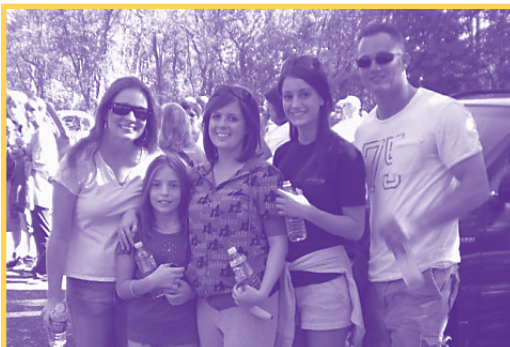
Family members and friends gather before the walk.