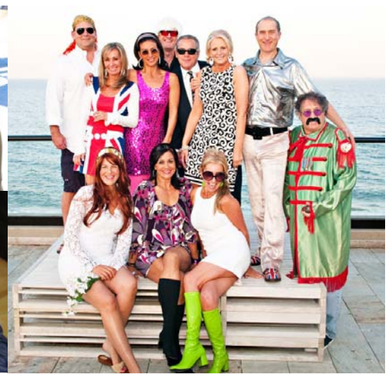
Come Together Gala 2010