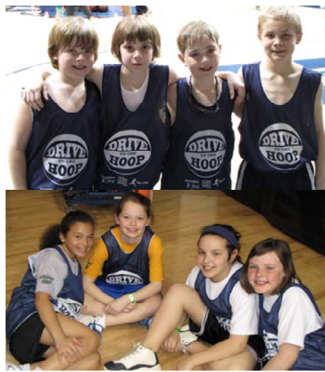
DRIVE TO THE HOOP 2010